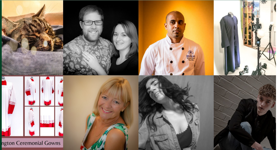
ington Ceremonial Gowns

Choosing this private portrait studio ensures a personalized and exclusive photography experience, where every session is tailored to capture your unique personality and style. With the focus on privacy and comfort, you can relax and be your true self, resulting in authentic and captivating portraits that stand out.