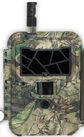
UOVision Cloud NEW!