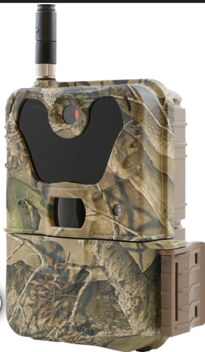
UOVision Cloud NEW!