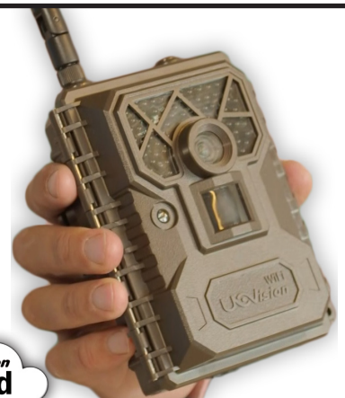
UOVision Cloud NEW!