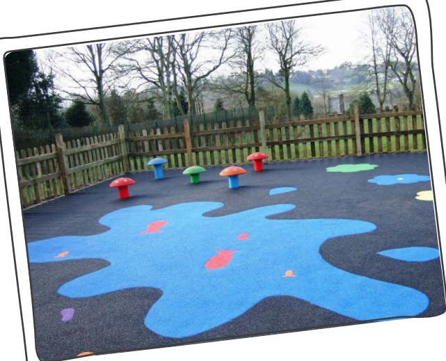
long lasting & maintenance free

Wetpour can be installed straight onto good quality tarmac and concrete with little groundworks required. This makes Wetpour a cost-effective safer surface for this type of sub-base.