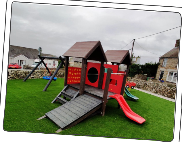
comfortable & safe solution

The Artificial Grass we supply and install consists of shock pads and absorbent layers to meet the current safety surfacing standard of BSEN 1177.