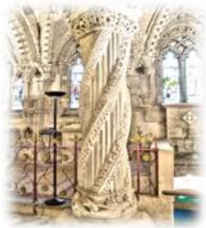
The Apprentice Pillar, Rosslyn Chapel

Sole occupancy of a twin or double room at a £20 per night supplement.