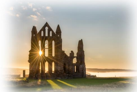
Dramatic ruins of Whitby Abbey

Sole occupancy of a twin or double room at a £10 per night supplement.