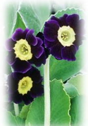
West Acre Gardens at Castle Acre