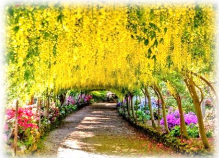
Beautiful Bodnant Gardens

Sole occupancy of a twin or double room at a £10 per night supplement