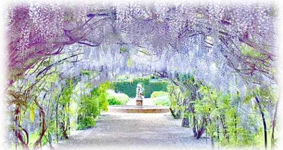
Wisteria Arch in Beaulieu Garden

Sole occupancy of a twin or double room at a £20 per night supplement.