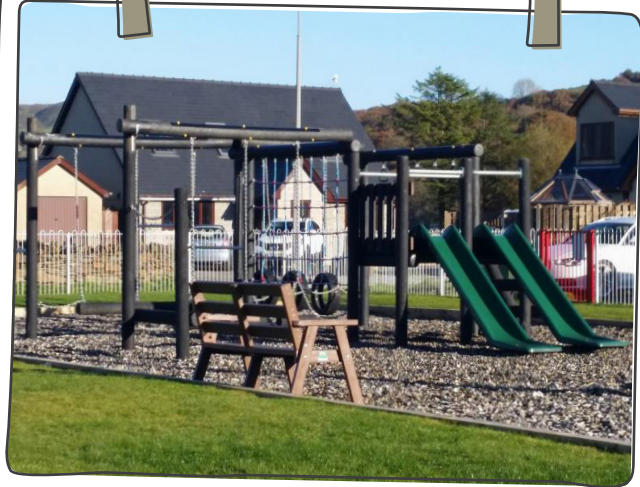
Multi-Play Climbing Frames