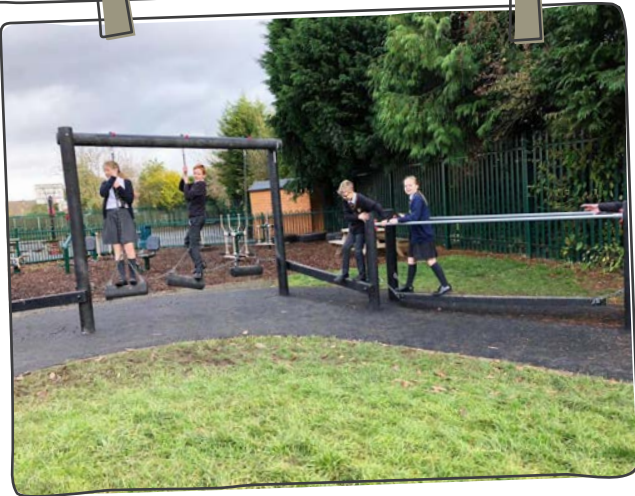
Fitness / Trim Trails