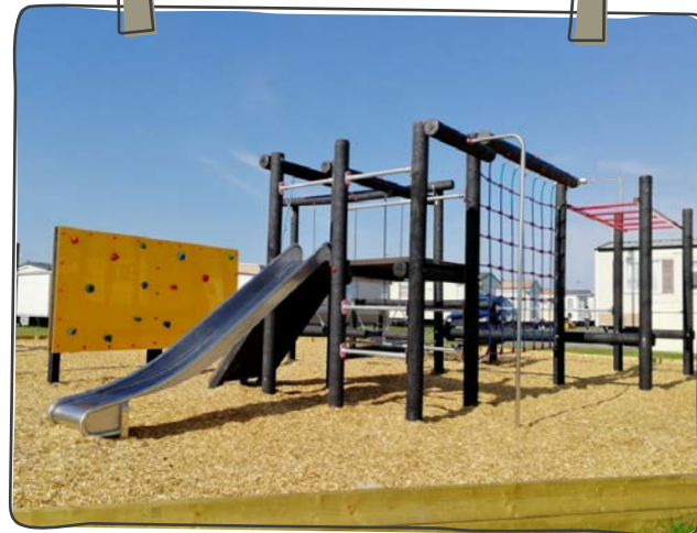
Play Centres & Climbing Frames