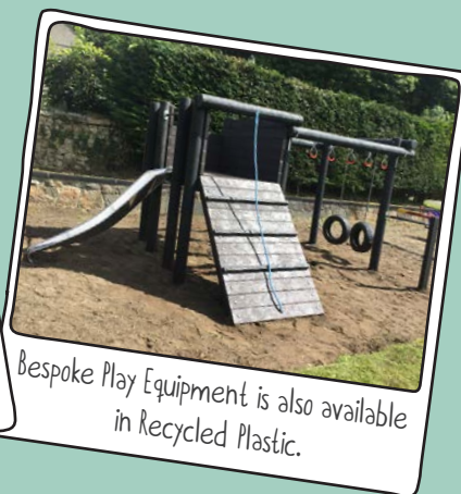
Bespoke Play Equipment is also available in Recycled Plastic.