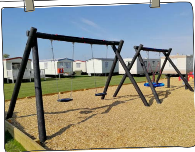
Swings & See-Saws