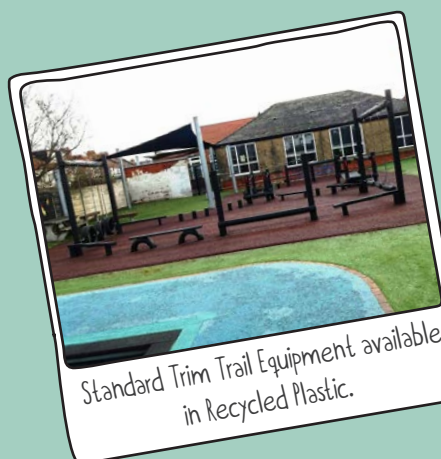
Standard Trim Trail Equipment available in Recycled Plastic.

THE MARKET LEADER IN RECYCLED PLASTIC PLAY EQUIPMENT!