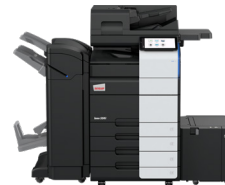
ineo 550i Mono system | 55ppm