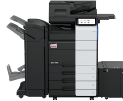
ineo+ 450i Colour system | 45ppm