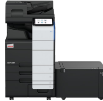
ineo+ 550i Colour system | 55ppm