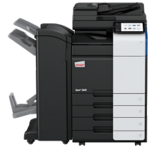
ineo+ 360i Colour system | 36ppm