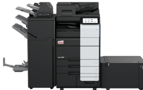
ineo 750i Mono system | 75ppm