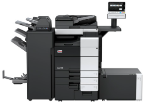
ineo 958 Mono system | 95ppm