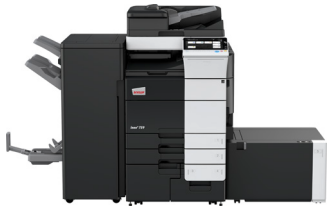
ineo+ 750i Colour system | 75ppm