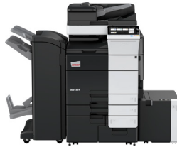
ineo+ 650i Colour system | 65ppm